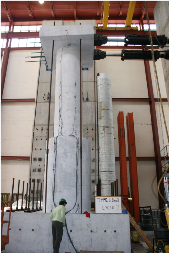
Full-scale column-pile assembly test